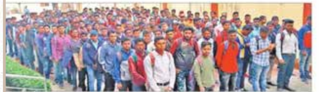
कैंपस सेलेक्शन में शामिल छात्र.