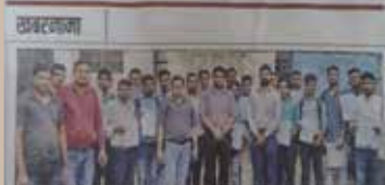
कैंपस में जुटी अर्थशास्त्रियों की भीड़.

Thu, 07 October 2021 https://epaper.prabhatkhabar.com